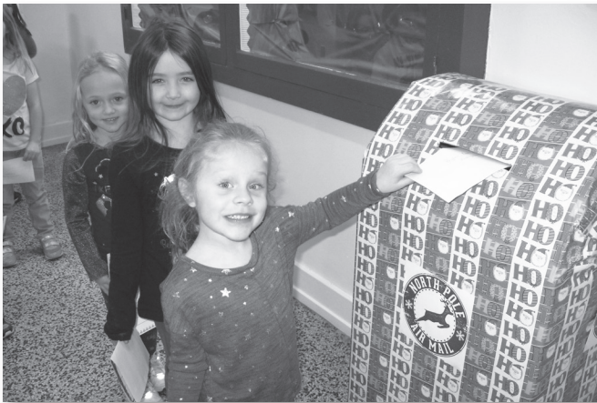
THE KINDERGARTEN CLASS WROTE SPECIAL LETTERS TO SANTA. THEY WERE VERY EXCITED TO MAIL THEM USING THE NORTH POLE AIR MAIL.