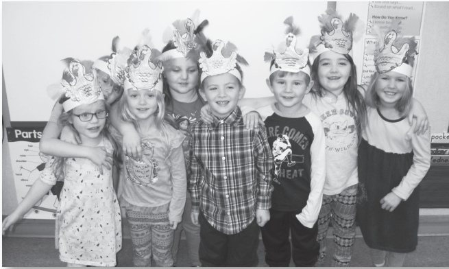
THE KINDERGARTENERS HAD FUN SINGING TWO SONGS TO THE SENIOR CITIZENS AT THE ANNUAL THANKSGIVING LUNCHEON. THEY ENJOYED MAKING THEIR TURKEY HATS!